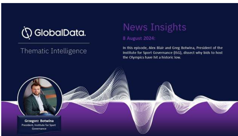
GRZEGORZ BOTWINA - FEATURED IN "INSTANT INSIGHTS - GLOBALDATA THEMATIC INTELLIGENCE" PODCAST