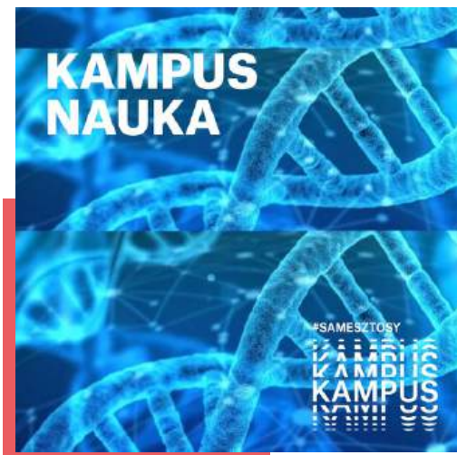
GRZEGORZ BOTWINA – GUEST ON "KAMPUS NAUKA" PODCAST