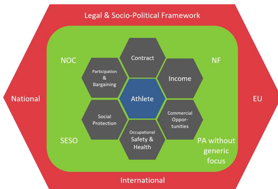
Figure 1: Conceptual Model of the Employment Relations of Athletes in Olympic Sports.

Figure 1 illustrates the conceptual model of athletes' employment relations in Olympic sports.